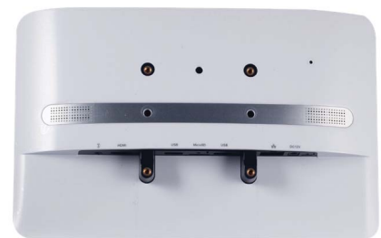
Connect Wall Mount Back