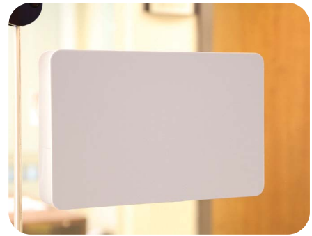
Connect Back Plate on Glass

Visit www.visix.com to learn more, and contact us for pricing at salesteam@visix.com .