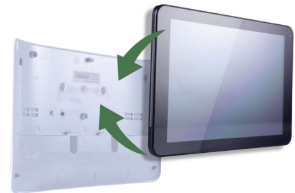
Connect Wall Mount